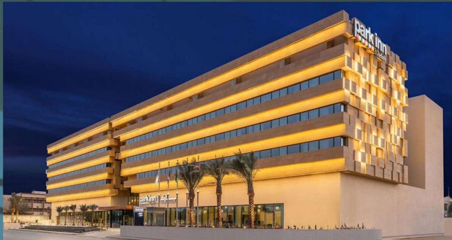
park inn by Radisson Park Inn by Radisson, Riyadh Street, Al Ihsaa, Az Zahra, Riyadh 12811, Saudi Arabia